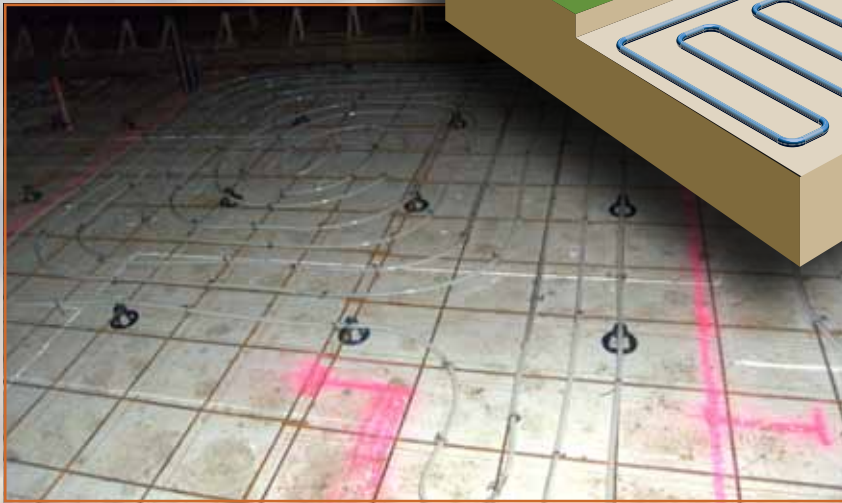
The under floor heating system. Heat generated by the captor field is used to heat water that is circulated through these pipes, installed in the concrete slab foundation.