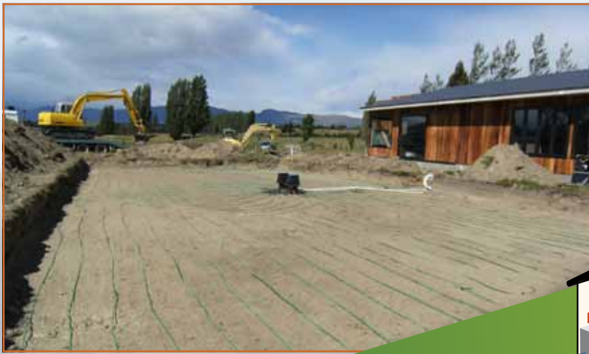
The "captor field" being installed.